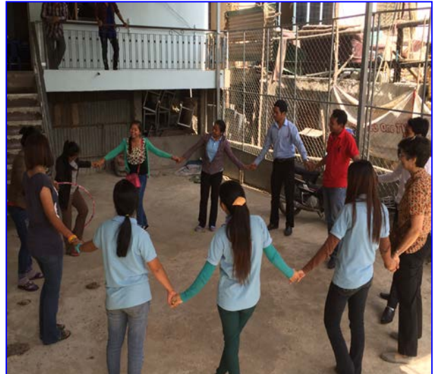
Demonstration of game building during teachers' teacher training