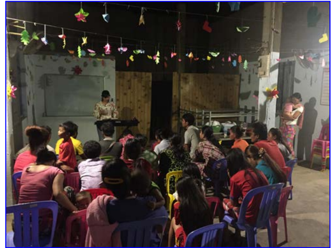
Light Church on Sunday evening service