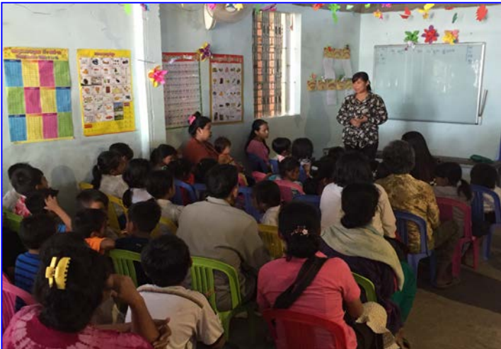
Teaching on how to protect children when parents are away at work on the day of parent's workshop