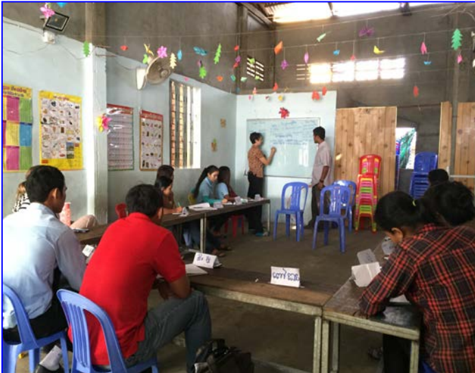
2 days Teachers' Training for all teachers of LFS