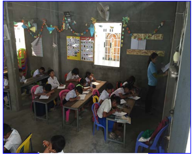
Learning more lessons