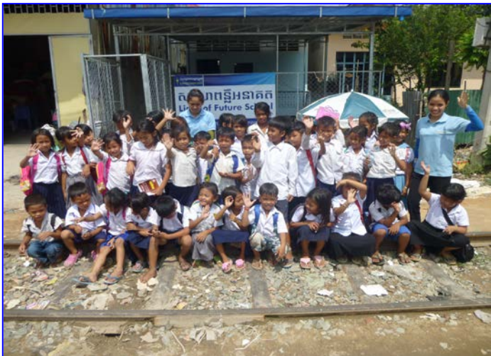
Group Photo in front of school