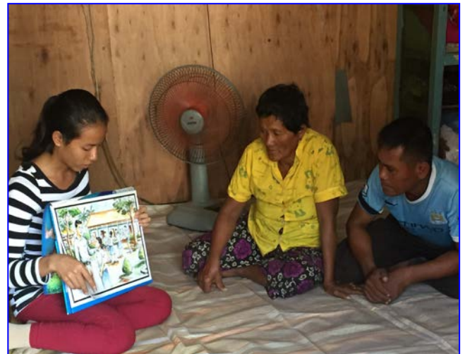
Educate community people about human trafficking