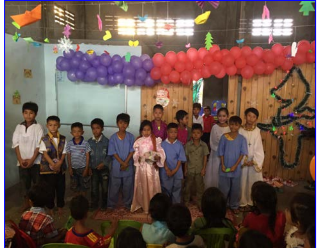
Drama performed by grade 2 students on Christmas Day