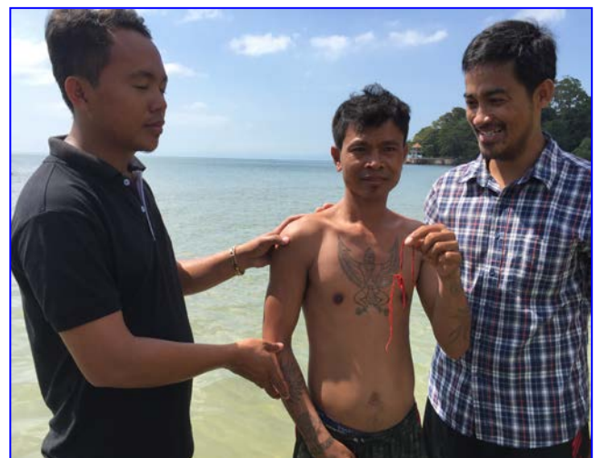
Received water baptism and cutting off demonic bracelets