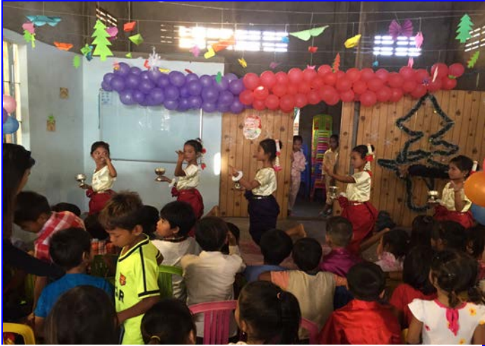
Traditional blessing dance performed by grade 2 students