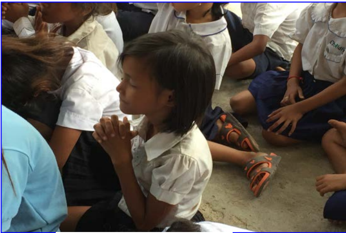
Praying to accept Christ