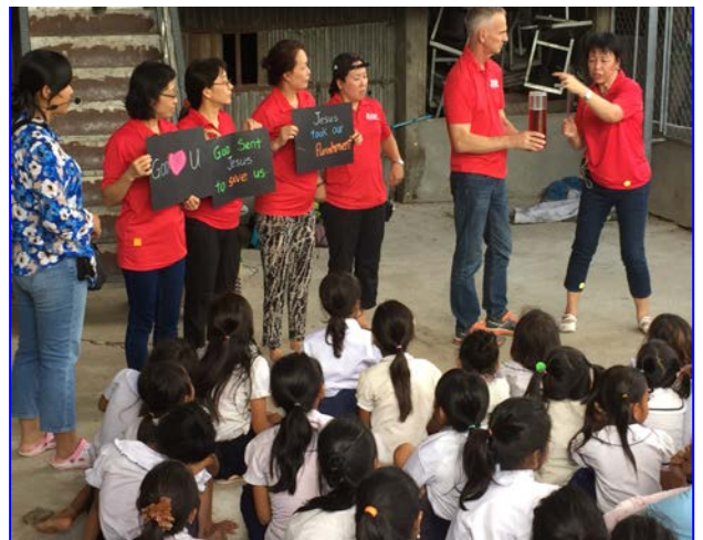
Drama performed by Singaporean Team