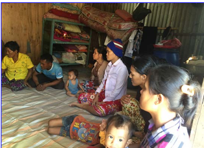
Community people joined small group