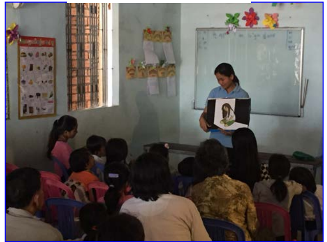
Teaching on how to protect children when parents are away at work on the day of parent's workshop