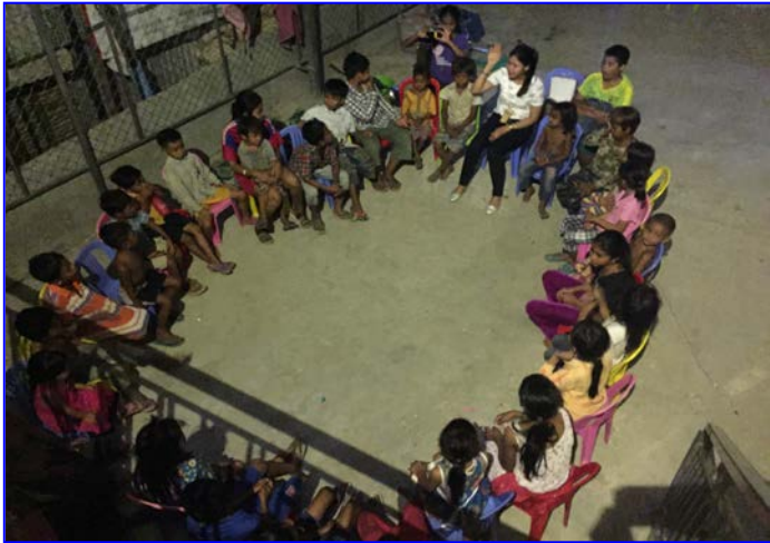
Children bible study on Sunday evening service