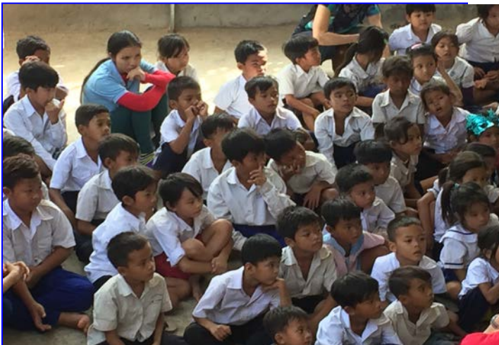
Students are watching drama performed by Singaporean Team