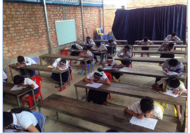
Students take their monthly exams