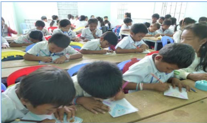
Students are doing their craft activities