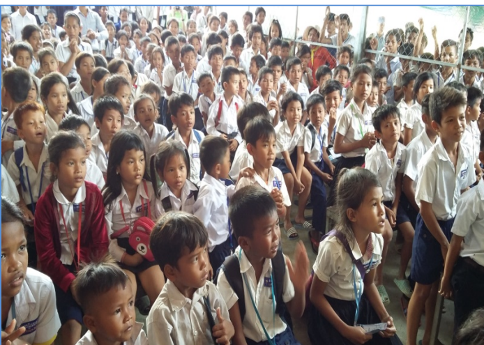
Students are listening to their school announcement