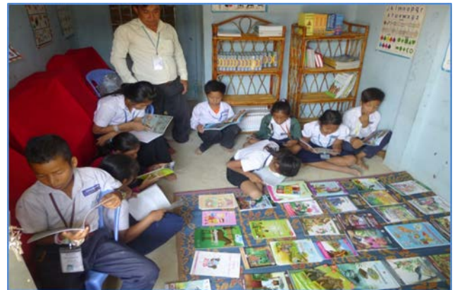
Setting up library