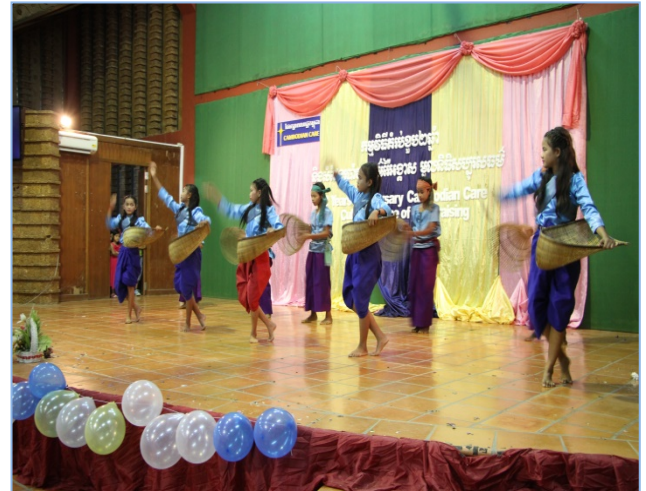
Cultural fishing dance performing by our grade 5 students on the occasion of 2 year anniversary of Cambodian Care