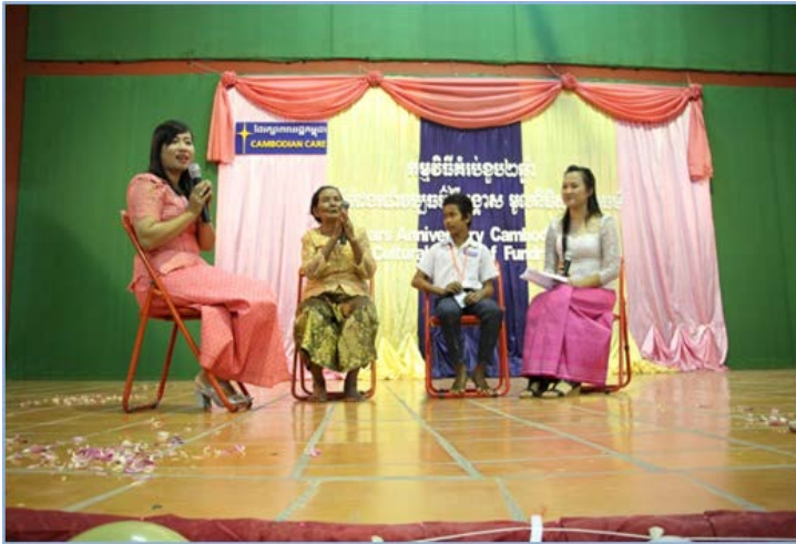
A testimony of life transformation through education program on the occasion of 2 year anniversary of Cambodian Care