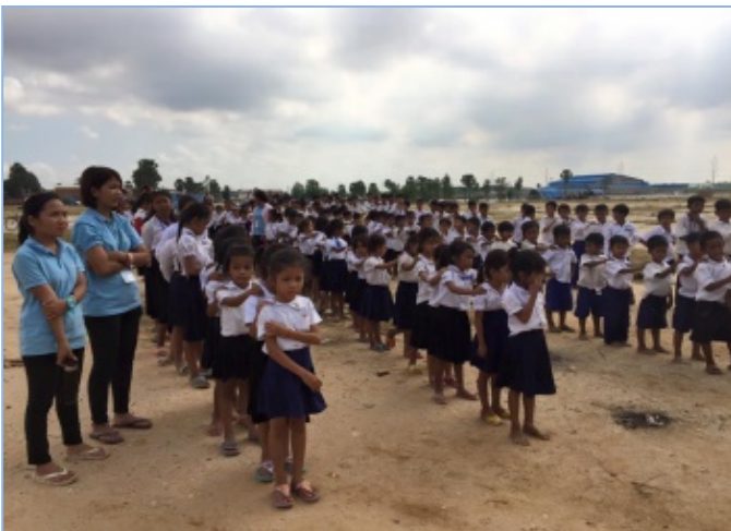
Lining up for getting into classes