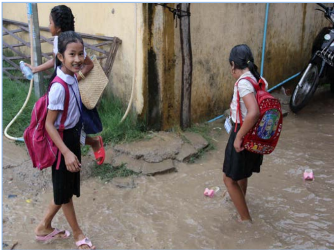
Our entrance to school is flooded