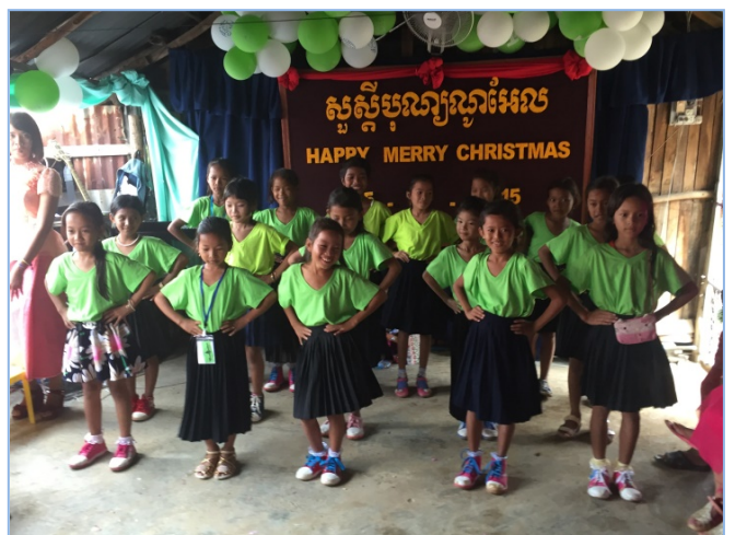
Special dance performed by grade 2