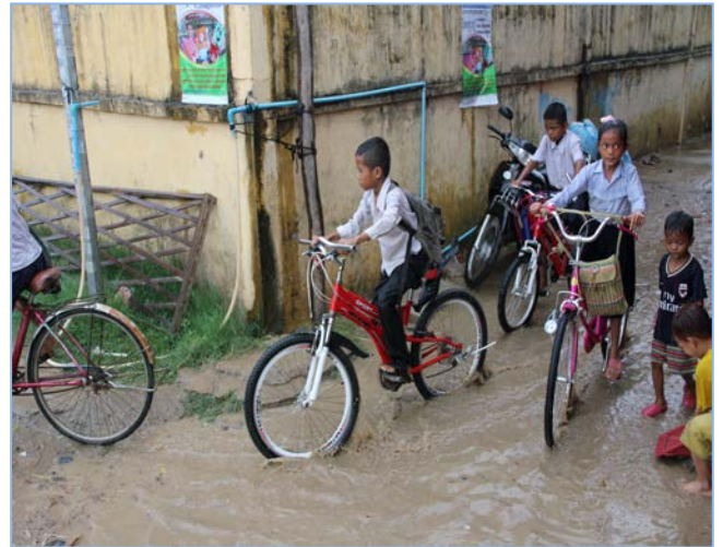
Going home after school