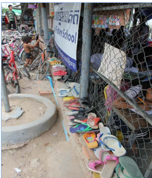
Their shoes are kept outside of classroom