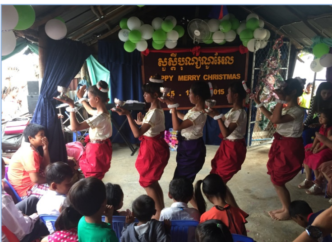
Performing traditional dance by grade 4 and 5