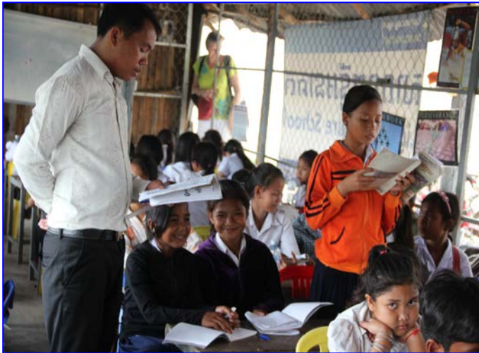
Improving reading skills in grade 4