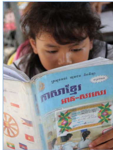
Improving reading skills