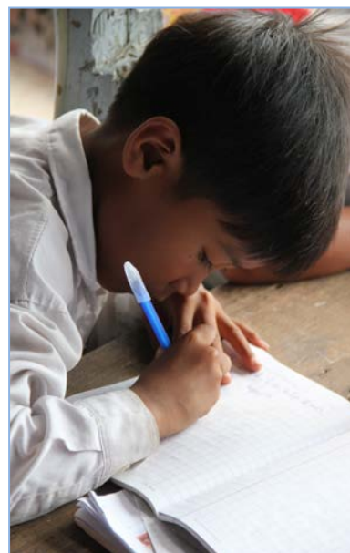
Improving writing skills