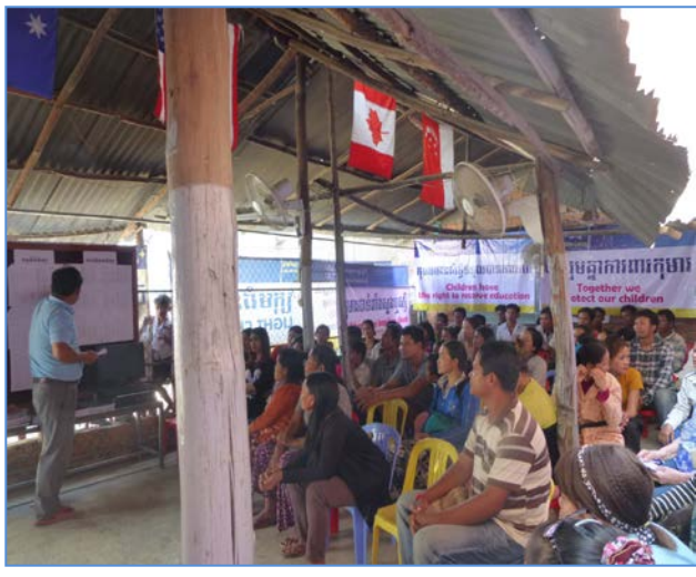
Explaining the school to parents/participation