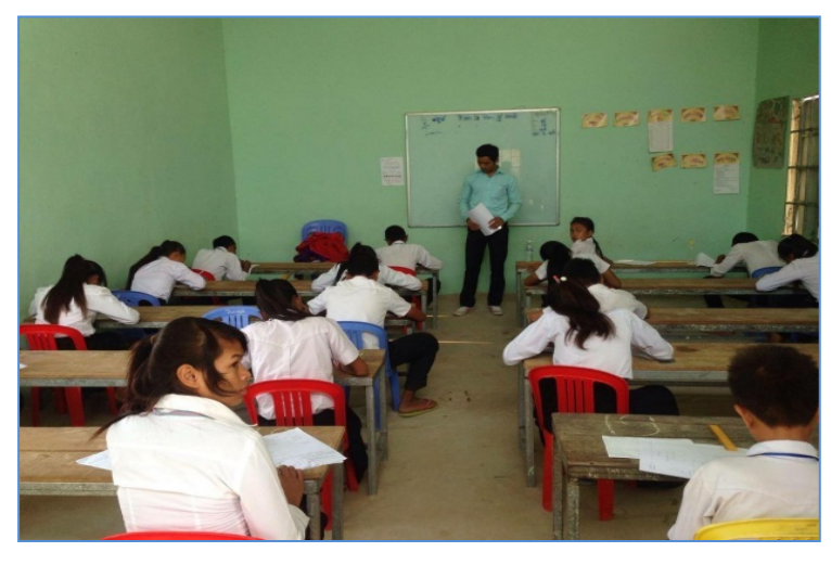
First semester exams