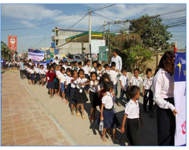
Community awareness on education