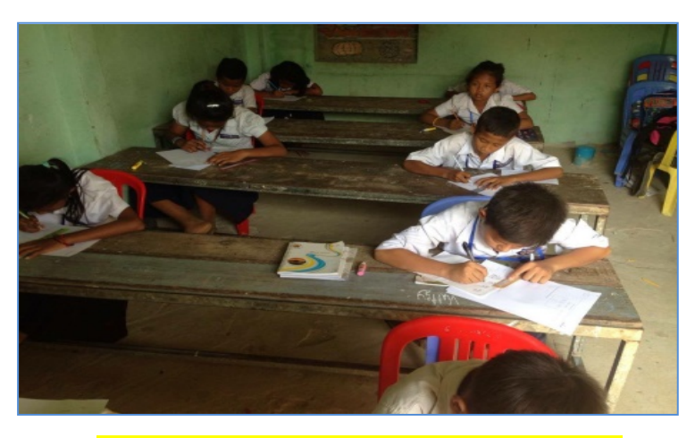
Students are strictly monitored during their exams