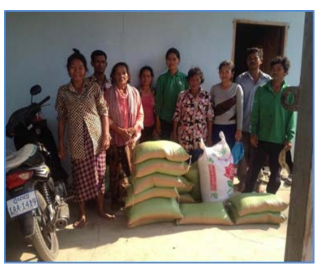
Families who receive rice support for their children