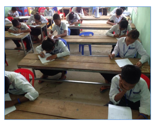
Students are seriously taking exams