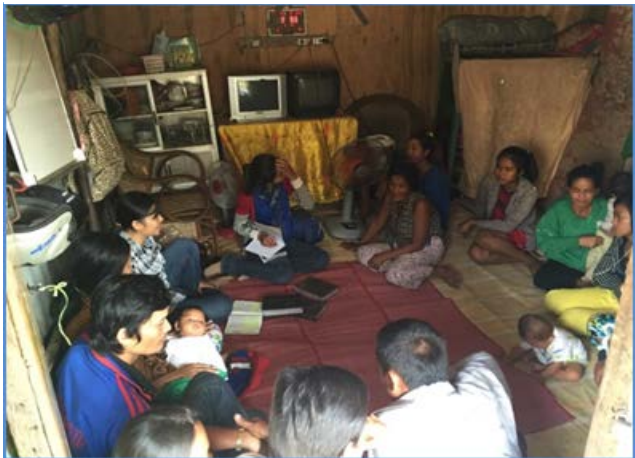
Home church meeting – bible study, health education and financial management