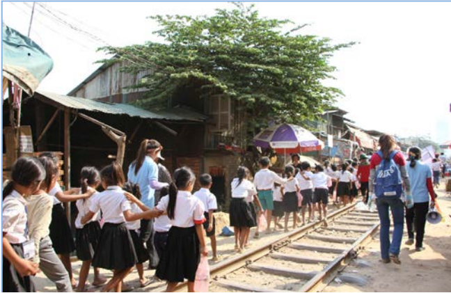
Children walked raising awareness on education and human trafficking