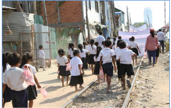
Community awareness on protecting children and education