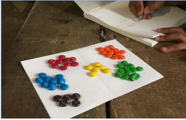
Techniques on teaching math