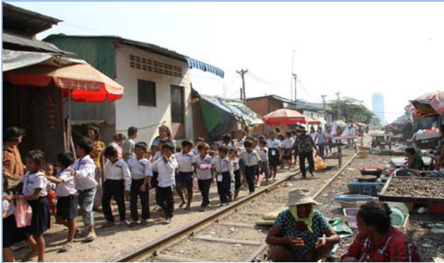
Raising awareness on human trafficking and important sending children to school