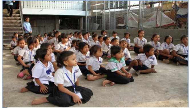
Instructions each day before class begins