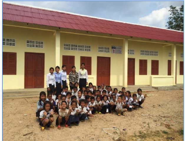
Children are so pleased with their new school finished building