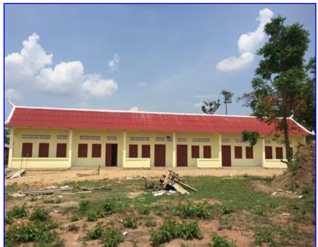
A finished school building