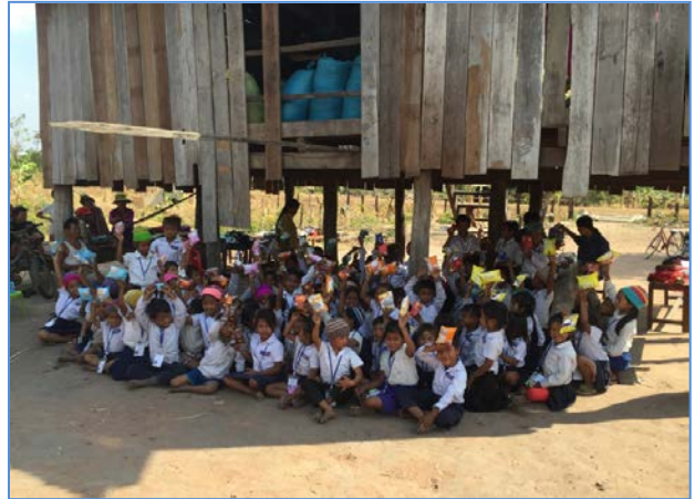
Children received their snack