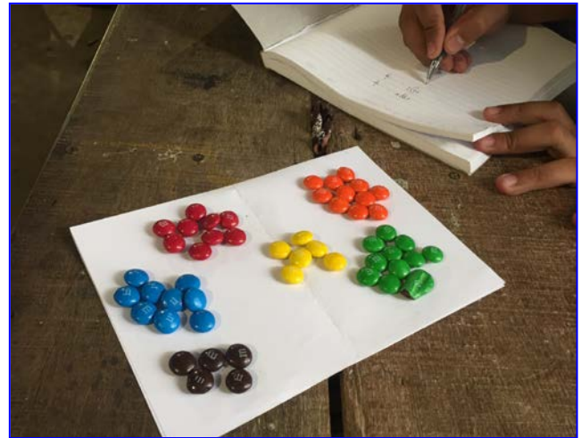
Techniques of learning and teaching