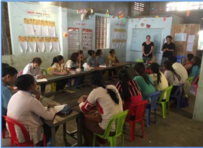
Teachers' training for all school teachers