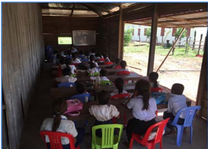
Children are actively learning in their class