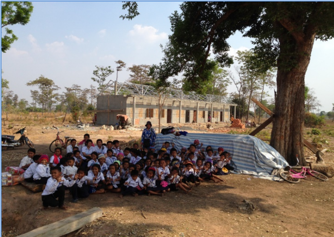
Children in front of their school progressing building