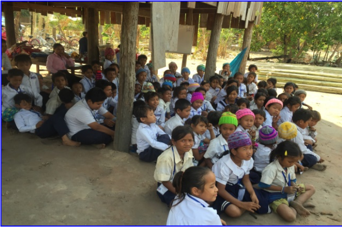
Children are listening to health education